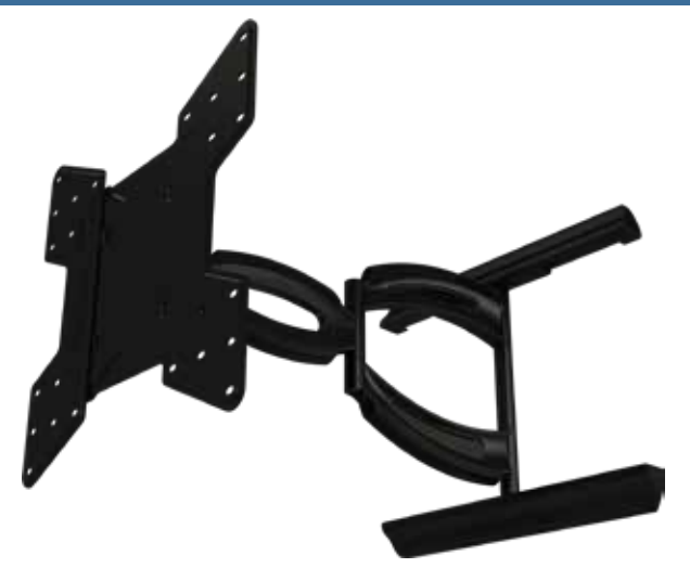
Articulating mount for 32" to 75" displays. Multiple joint arm holds display 3.5" from wall when retracted and 27" when fully extended. Smooth tilt adjustments of +15° (forward) and -5° (back) with a locking knob and 3° side-to-side roll facilitates a variety of viewing angles and perfect positioning. Integrated cable management for clean look.