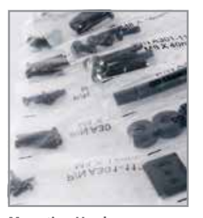
Mounting Hardware Complete set of mounting hardware, labeled for ease of use and ready to go.