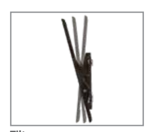
15° forward and 5° back tilt for optimal