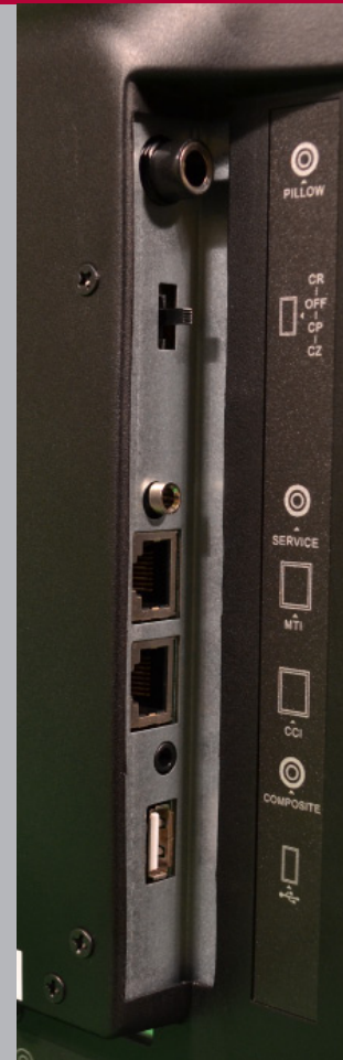
Side Input Panel

This ENERGY STAR® qualified healthcare television by PDi offers your facility the added benefit of operational cost savings from reduced power consumption, without compromising quality or patient comfort. You can make a difference with this environmentally conscious choice to help preserve our environment for generations to follow. ENERGY STAR is a registered mark owned by the US government. This product also meets the regulatory compliance requirements of the California Energy Commission.