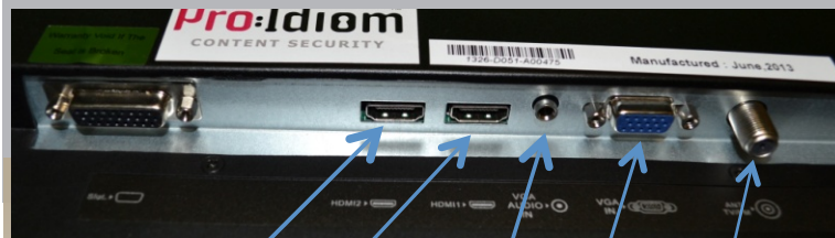
HDMI2 HDMI1 VGA Audio In VGA In ANT/TV/CBL