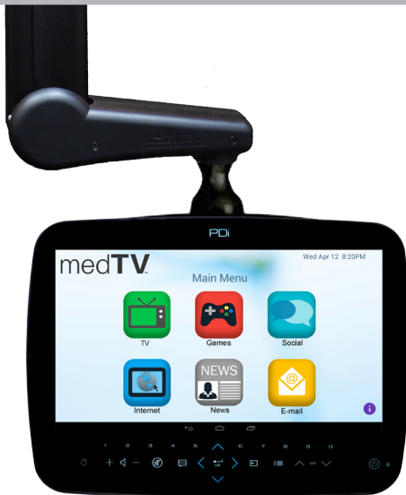
med TAB 14

For patients who just can't break away from work or personal e-mails.