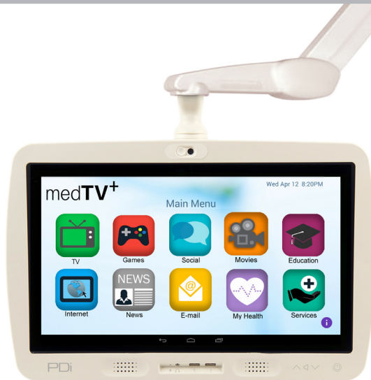
med TAB 19