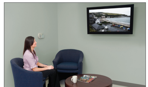
In waiting rooms, audio is brought to the seating area, helping to create a quieter atmosphere.