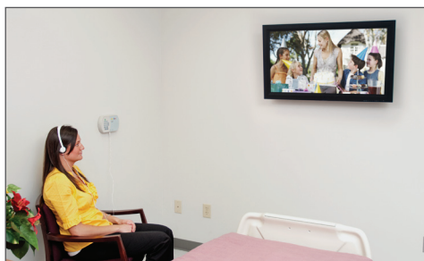
Visitors can watch television in the hospital room without disturbing the patient.