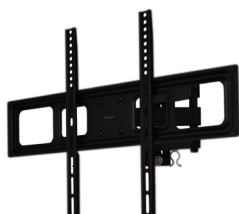
ARTICULATING WALL BRACKET