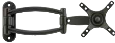
ARTICULATING WALL MOUNT STAND