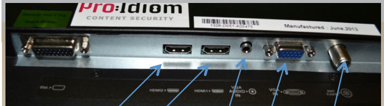
HDMI2 HDMI1 VGA Audio In VGA In ANT/TV/CBL