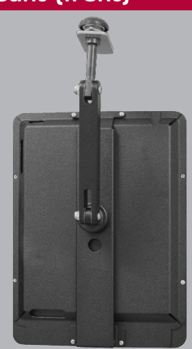
Tablet Mount (back)