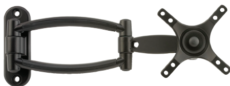
ARTICULATING WALL MOUNT STAND