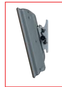
Adjustable +15/-5° tilt